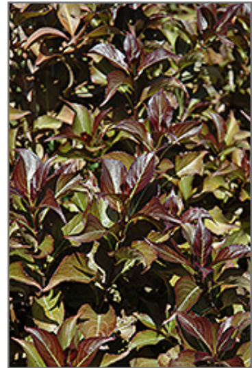
Dark Horse Weigela foliage

Dark Horse Weigela makes a fine choice for the outdoor landscape, but it is also well-suited for use in outdoor pots and containers. Because of its height, it is often used as a 'thriller' in the 'spiller-thriller-filler' container combination; plant it near the center of the pot, surrounded by smaller plants and those that spill over the edges. It is even sizeable enough that it can be grown alone in a suitable container. Note that when grown in a container, it may not perform exactly as indicated on the tag - this is to be expected. Also note that when growing plants in outdoor containers and baskets, they may require more frequent waterings than they would in the yard or garden.