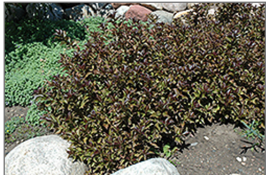
Dark Horse Weigela