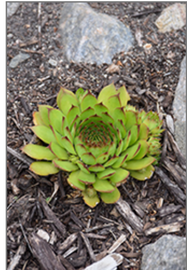
Sunset Hens And Chicks

Sunset Hens And Chicks is recommended for the following landscape applications;