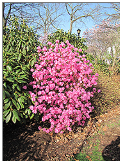
Landmark Rhododendron in bloom