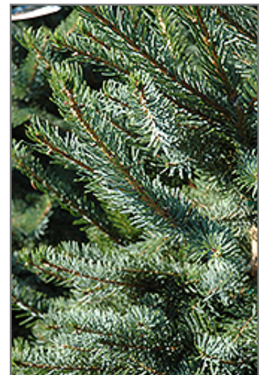
Bruns Spruce foliage