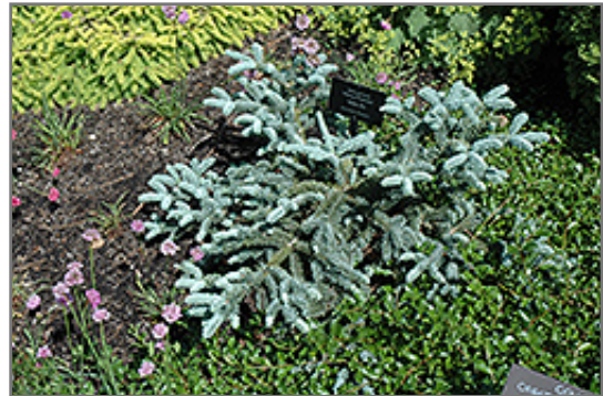
Prostrate Blue Noble Fir