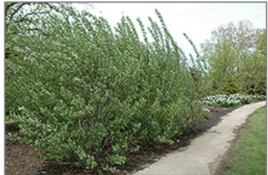
French Pussy Willow