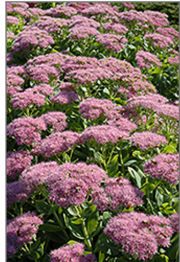
Brilliant Stonecrop flowers

Brilliant Stonecrop is recommended for the following landscape applications;