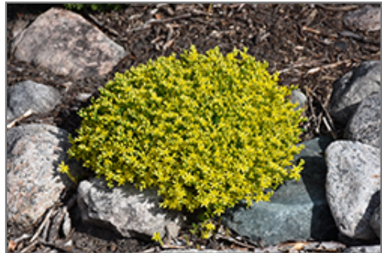
Golden Moss Stonecrop in bloom

Golden Moss Stonecrop is recommended for the following landscape applications;