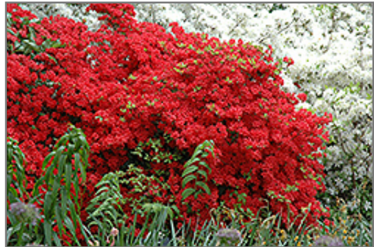
Stewartstonian Azalea in bloom

Stewartstonian Azalea is recommended for the following landscape applications;