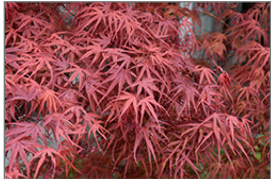
Beni Otake Japanese Maple foliage

Beni Otake Japanese Maple is recommended for the following landscape applications;