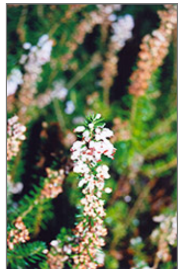
Scotch Heather flowers