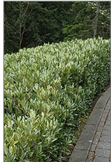
Otto Luyken Dwarf Cherry Laurel in bloom