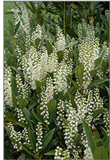
Otto Luyken Dwarf Cherry Laurel flowers

Otto Luyken Dwarf Cherry Laurel is recommended for the following landscape applications;