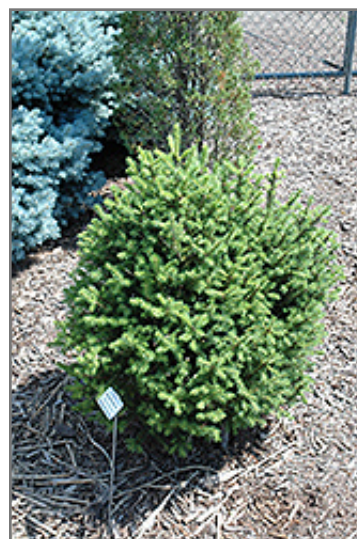
Sherwood Compact Norway Spruce

Sherwood Compact Norway Spruce is recommended for the following landscape applications;