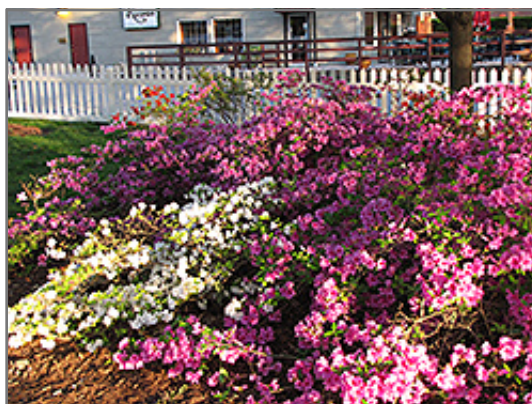
Purple Splendor Azalea in bloom