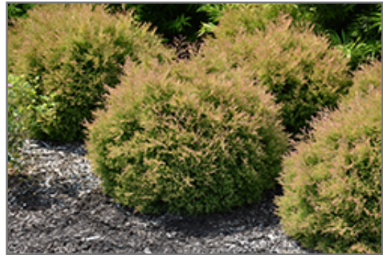
Fire Chief Arborvitae

Fire Chief Arborvitae will grow to be about 5 feet tall at maturity, with a spread of 5 feet. It tends to fill out right to the ground and therefore doesn't necessarily require facer plants in front, and is suitable for planting under power lines. It grows at a slow rate, and under ideal conditions can be expected to live for approximately 30 years.