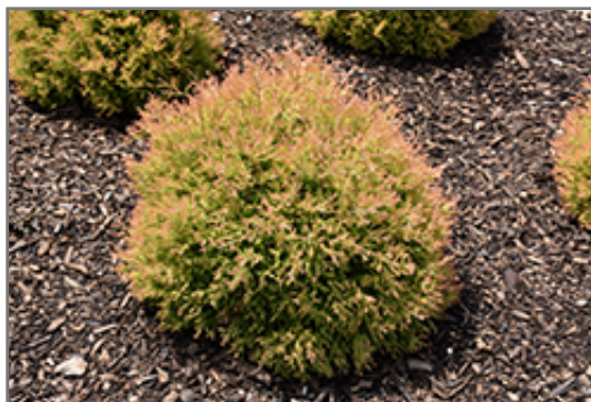
Fire Chief Arborvitae

Fire Chief Arborvitae is recommended for the following landscape applications;