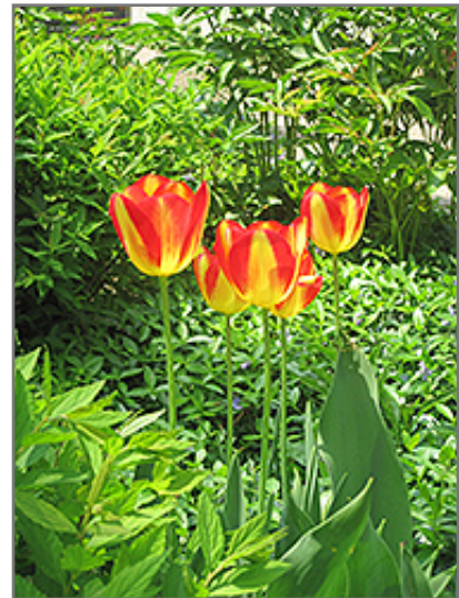
Antoinette Tulip in bloom