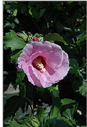
Minerva Rose of Sharon flowers

Minerva Rose of Sharon is recommended for the following landscape applications;