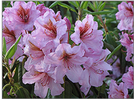
Kabarett Rhododendron flowers

Kabarett Rhododendron is recommended for the following landscape applications;