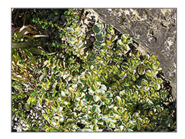
Variegated October Daphne in bloom

Variegated October Daphne is recommended for the following landscape applications;