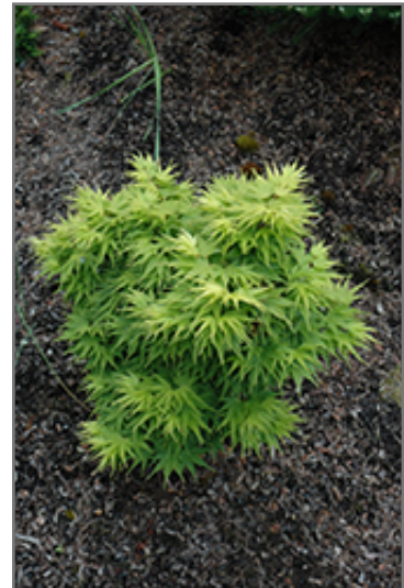
Mikawa Yatsubusa Japanese Maple

Mikawa Yatsubusa Japanese Maple is a fine choice for the yard, but it is also a good selection for planting in outdoor pots and containers. With its upright habit of growth, it is best suited for use as a 'thriller' in the 'spiller-thriller-filler' container combination; plant it near the center of the pot, surrounded by smaller plants and those that spill over the edges. It is even sizeable enough that it can be grown alone in a suitable container. Note that when grown in a container, it may not perform exactly as indicated on the tag - this is to be expected. Also note that when growing plants in outdoor containers and baskets, they may require more frequent waterings than they would in the yard or garden.