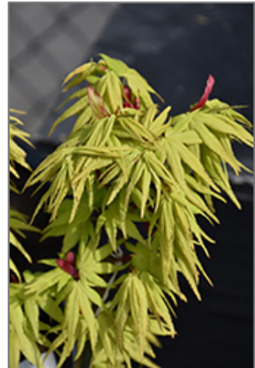
Mikawa Yatsubusa Japanese Maple foliage

Mikawa Yatsubusa Japanese Maple is recommended for the following landscape applications;