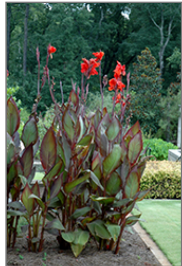
Australia Canna in bloom