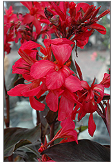
Australia Canna flowers

This plant should only be grown in full sunlight. It requires an evenly moist well-drained soil for optimal growth, but will die in standing water. It is not particular as to soil pH, but grows best in rich soils. It is highly tolerant of urban pollution and will even thrive in inner city environments, and will benefit from being planted in a relatively sheltered location. Consider applying a thick mulch around the root zone in winter to protect it in exposed locations or colder microclimates. This particular variety is an interspecific hybrid. It can be propagated by division; however, as a cultivated variety, be aware that it may be subject to certain restrictions or prohibitions on propagation.