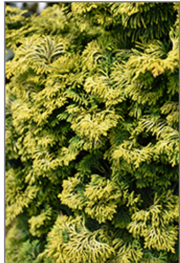
Dwarf Golden Hinoki Falsecypress foliage