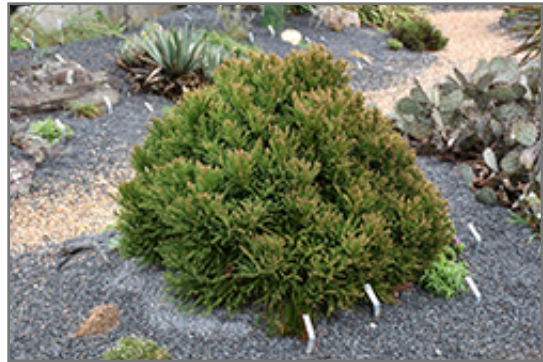
Little Diamond Japanese Cedar

This shrub does best in full sun to partial shade. It prefers to grow in average to moist conditions, and shouldn't be allowed to dry out. It is particular about its soil conditions, with a strong preference for rich, acidic soils, and is able to handle environmental salt. It is quite intolerant of urban pollution, therefore inner city or urban streetside plantings are best avoided, and will benefit from being planted in a relatively sheltered location. Consider applying a thick mulch around the root zone in winter to protect it in exposed locations or colder microclimates. This is a selected variety of a species not originally from North America.