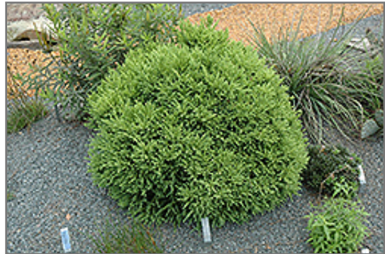
Little Diamond Japanese Cedar