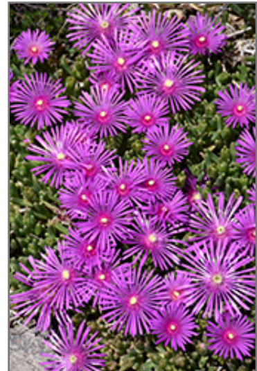
Purple Ice Plant flowers

This is a relatively low maintenance plant, and is best cleaned up in early spring before it resumes active growth for the season. It is a good choice for attracting bees and butterflies to your yard, but is not particularly attractive to deer who tend to leave it alone in favor of tastier treats. It has no significant negative characteristics.