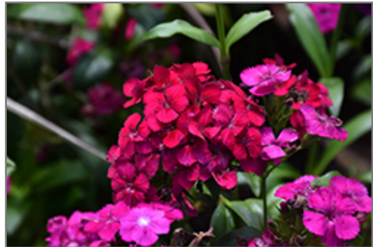
Amazon Neon Cherry Pinks flowers