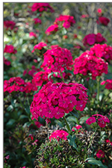
Amazon Neon Cherry Pinks flowers

Amazon Neon Cherry Pinks is an herbaceous annual with a mounded form. It brings an extremely fine and delicate texture to the garden composition and should be used to full effect.