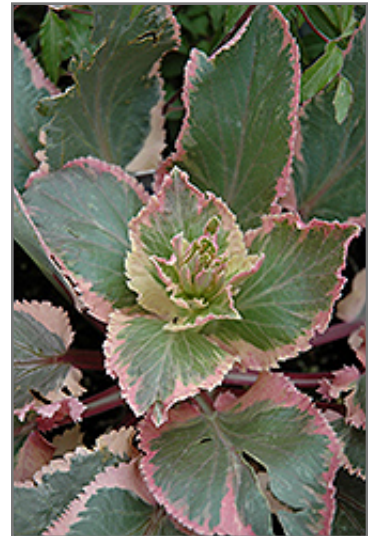
Jade Frost Variegated Sea Holly foliage