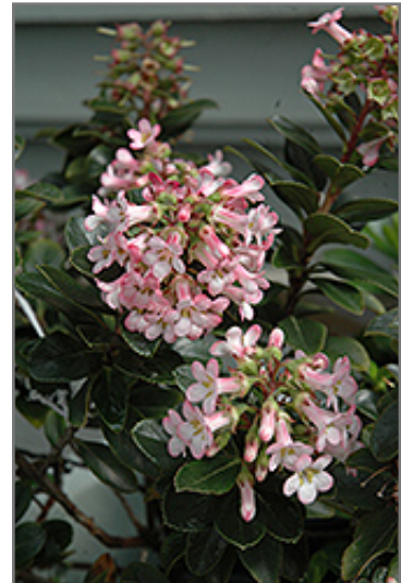
Pink Princess Escallonia flowers

Pink Princess Escallonia is recommended for the following landscape applications;