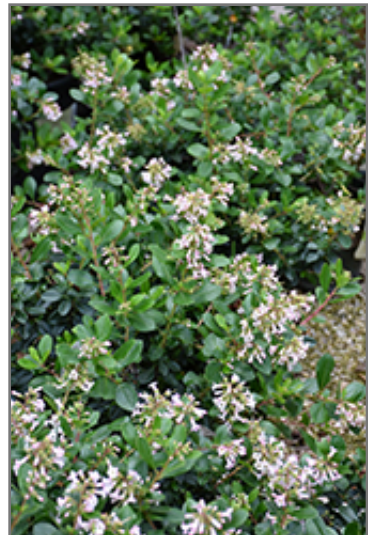
Pink Princess Escallonia in bloom