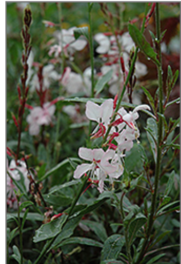
Ballerina Blush Gaura flowers

Ballerina Blush Gaura is an open herbaceous perennial with tall flower stalks held atop a low mound of foliage. It brings an extremely fine and delicate texture to the garden composition and should be used to full effect.