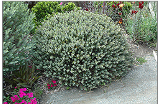
Red Edge Hebe

Red Edge Hebe is recommended for the following landscape applications;