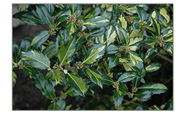
Silver Variegated English Holly foliage

Silver Variegated English Holly will grow to be about 30 feet tall at maturity, with a spread of 12 feet. It has a low canopy with a typical clearance of 2 feet from the ground, and should not be planted underneath power lines. It grows at a medium rate, and under ideal conditions can be expected to live for 50 years or more.