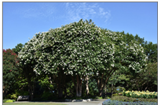
Natchez Crapemyrtle in bloom