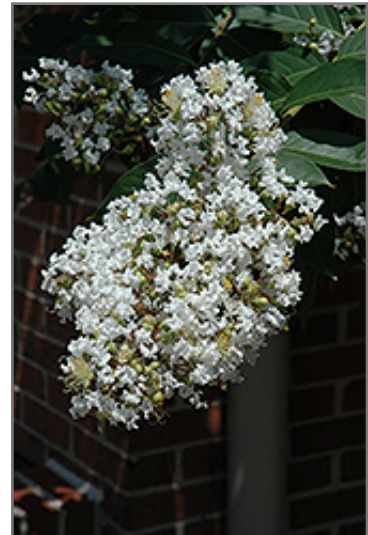
Natchez Crapemyrtle flowers

Natchez Crapemyrtle is a dense multi-stemmed deciduous tree with a shapely form and gracefully arching branches. Its average texture blends into the landscape, but can be balanced by one or two finer or coarser trees or shrubs for an effective composition.