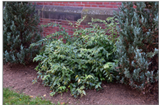
Rainbow Fetterbush