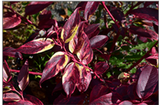
Rainbow Fetterbush in fall