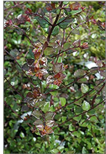
Red Tips Box Honeysuckle foliage

Red Tips Box Honeysuckle is recommended for the following landscape applications;