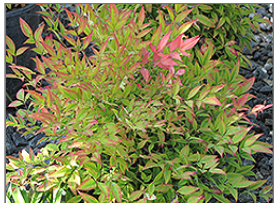
Moon Bay Dwarf Nandina