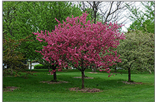
Prairifire Flowering Crab in bloom

Prairifire Flowering Crab is a deciduous tree with an upright spreading habit of growth. Its average texture blends into the landscape, but can be balanced by one or two finer or coarser trees or shrubs for an effective composition.