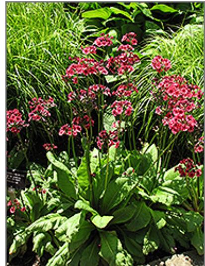
Miller's Crimson Primrose in bloom

Miller's Crimson Primrose is recommended for the following landscape applications;