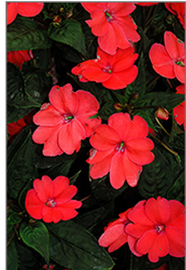
SunPatiens Compact Coral New Guinea Impatiens flowers

SunPatiens Compact Coral New Guinea Impatiens is recommended for the following landscape applications;