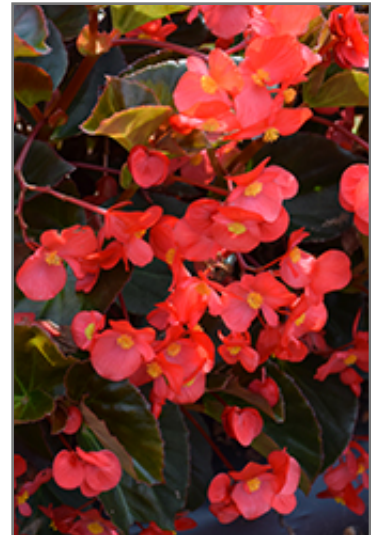
Big Red Bronze Leaf Begonia flowers

Big Red Bronze Leaf Begonia will grow to be about 18 inches tall at maturity, with a spread of 18 inches. When grown in masses or used as a bedding plant, individual plants should be spaced approximately 16 inches apart. Its foliage tends to remain dense right to the ground, not requiring facer plants in front. Although it's not a true annual, this plant can be expected to behave as an annual in our climate if left outdoors over the winter, usually needing replacement the following year. As such, gardeners should take into consideration that it will perform differently than it would in its native habitat.