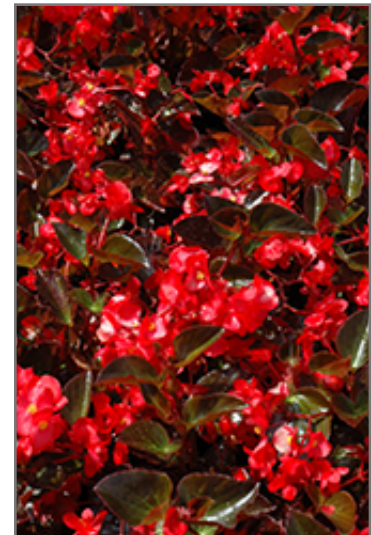
Big Red Bronze Leaf Begonia flowers