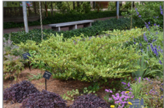
Vintage Jade Witch Hazel

Vintage Jade Witch Hazel is recommended for the following landscape applications;