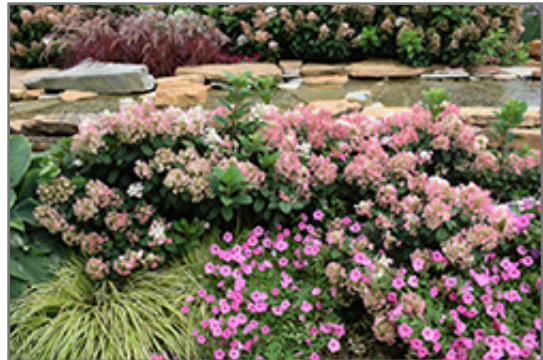
Little Quick Fire Hydrangea in bloom

Little Quick Fire Hydrangea makes a fine choice for the outdoor landscape, but it is also well-suited for use in outdoor pots and containers. With its upright habit of growth, it is best suited for use as a 'thriller' in the 'spiller-thriller-filler' container combination; plant it near the center of the pot, surrounded by smaller plants and those that spill over the edges. It is even sizeable enough that it can be grown alone in a suitable container. Note that when grown in a container, it may not perform exactly as indicated on the tag - this is to be expected. Also note that when growing plants in outdoor containers and baskets, they may require more frequent waterings than they would in the yard or garden.