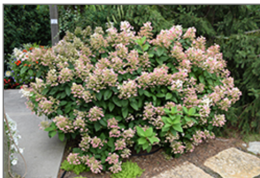
Little Quick Fire Hydrangea in bloom