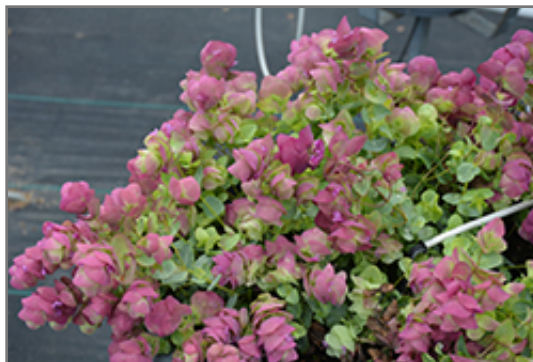
Kirigami Oregano in bloom