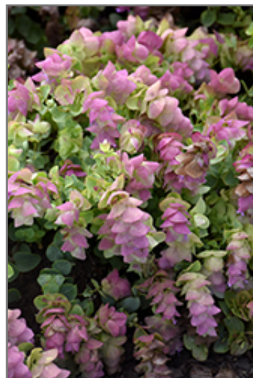
Kirigami Oregano flowers

Kirigami Oregano is an herbaceous perennial with an upright spreading habit of growth. Its relatively fine texture sets it apart from other garden plants with less refined foliage.