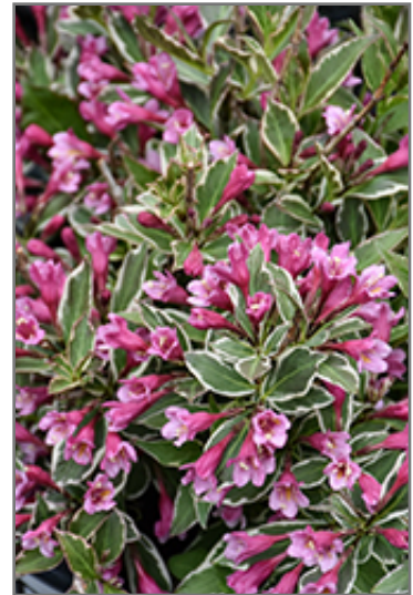
My Monet Purple Effect Weigela flowers

This shrub will require occasional maintenance and upkeep, and should only be pruned after flowering to avoid removing any of the current season's flowers. It is a good choice for attracting hummingbirds to your yard. It has no significant negative characteristics.