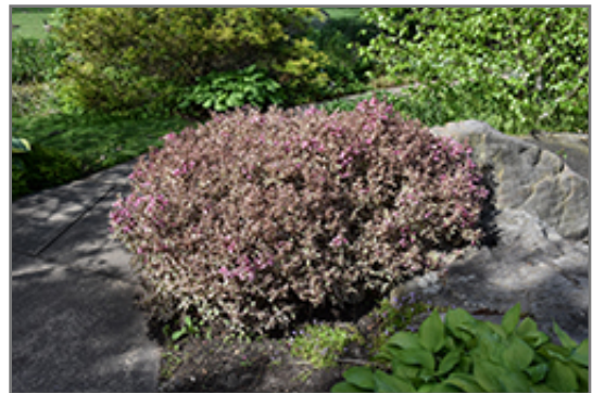
My Monet Purple Effect Weigela in bloom