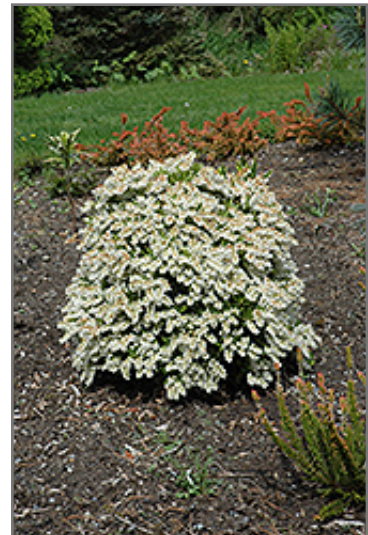
Prelude Japanese Pieris in bloom