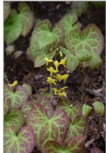
Froehnleiten Bishop's Hat flowers

Froehnleiten Bishop's Hat is a fine choice for the garden, but it is also a good selection for planting in outdoor pots and containers. Because of its spreading habit of growth, it is ideally suited for use as a 'spiller' in the 'spiller-thriller-filler' container combination; plant it near the edges where it can spill gracefully over the pot. Note that when growing plants in outdoor containers and baskets, they may require more frequent waterings than they would in the yard or garden.