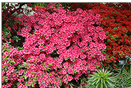
Girard's Rose Azalea in bloom