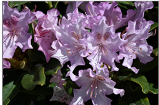
Pohjola's Daughter Rhododendron flowers

A relatively new broadleaf evergreen shrub with delicate white flowers that emerge from red buds in spring, coarse dark foliage and a broadly compact habit; absolutely must have well-drained, highly acidic and organic soil, use plenty of peat moss